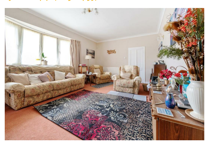
Large front aspect bay window, radiator, door leading to: